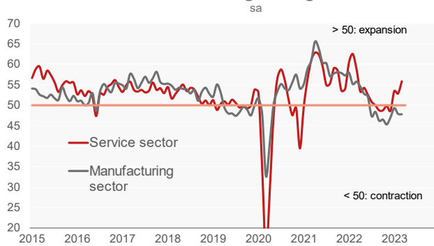
UK Purchasing Manager Index

Accordingly, the BoEs next decisions will depend on actual developments. We see headline inflation to drop quite significantly in April (even assuming last month's high 0.8% mom growth, yoy CPI inflation were to fall to 8.2% yoy on base effects) and beyond, but core inflation is likely to stay sticky. Food prices (a main driver of upside surprises of CPI headline inflation, given the food shortages), rising in March by 19.1% yoy and utilities inflation (up in March by 26.1% yoy) suggest core service inflation to see still ongoing second round effects. For example, inflation in the CPI subcomponent "Hotels, Cafes and Restaurants" saw price increases of 11.3% of late, rolling over higher food, utility, and labour costs. Together with tightness in the labour market, we see another hike in the next meeting now more likely than not. Even a second one cannot be excluded, although weakness in global growth in H2 might well prevent this. We stress that ultimately next data releases will be decisive. Markets responded calmly to the news.